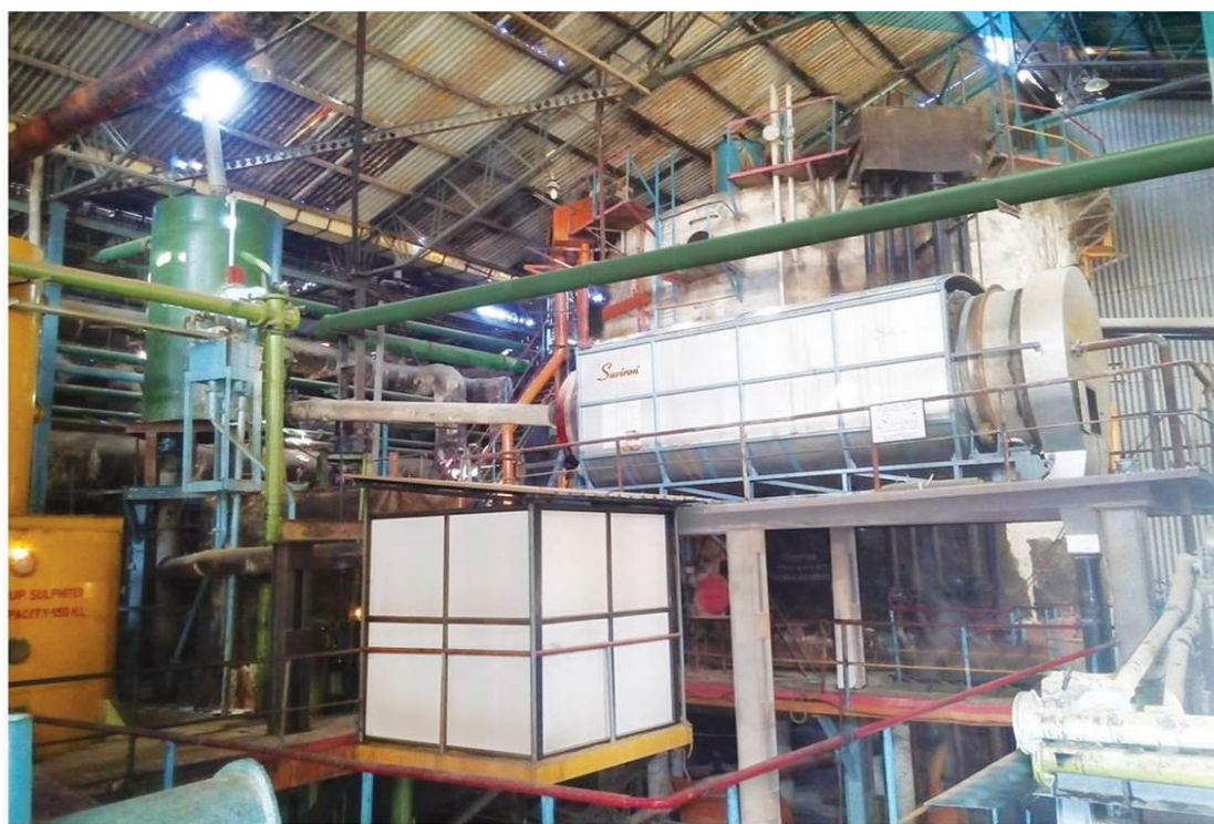
Data collection at various installations of Hot Raw Juice Screening System :